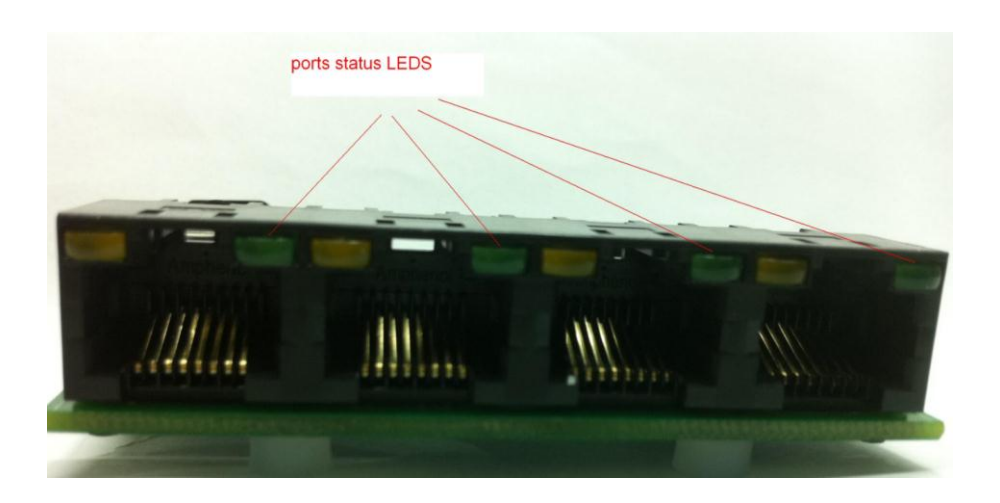
Figure 4: LEDs Indication