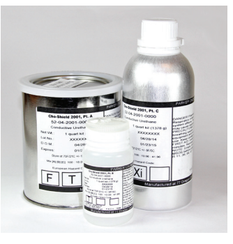
Table 3: Conductive Coatings - Ordering Information