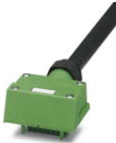
Sensor/actuator connector hood, with master cable, marking label, for an SAC box with 6 double-occupied slots

Please be informed that the data shown in this PDF Document is generated from our Online Catalog. Please find the complete data in the user's documentation. Our General Terms of Use for Downloads are valid ( http://download.phoenixcontact.com )